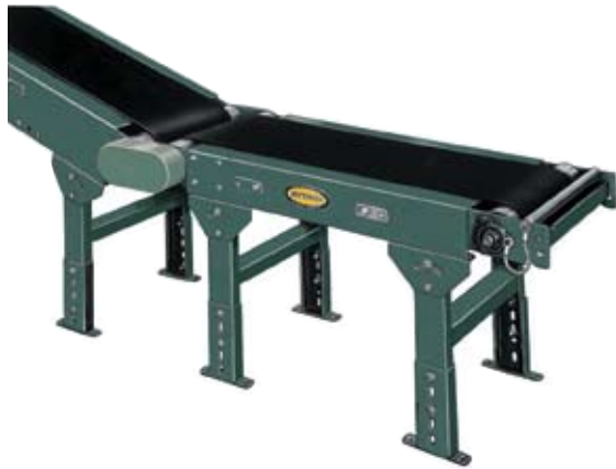
SHOWN WITH OPTIONAL LOWER POWERED FEEDER AND SUPPORTS

FLOOR SUPPORTS —Now supplied as optional equipment.