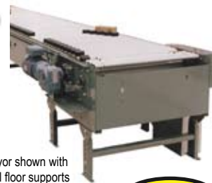
Conveyor shown with optional floor supports