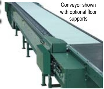
Conveyor shown with optional floor supports