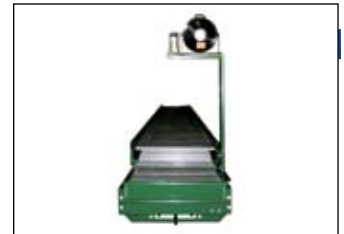
Fan and Light