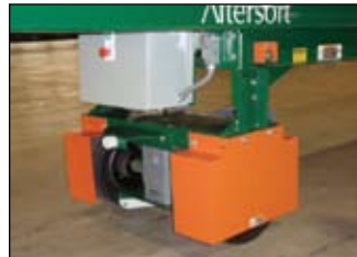
Changeable Drive System